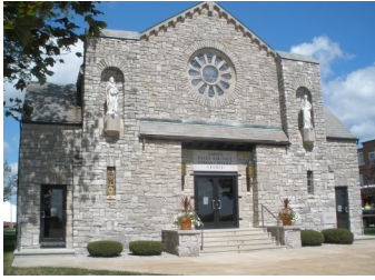
7121 E Atwater Rd., Ruth MI