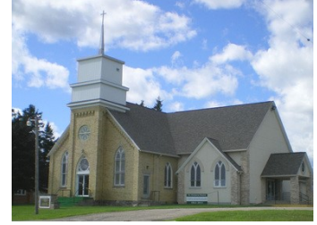
1801 Palms Rd., Palms, MI