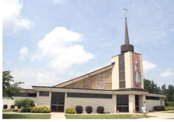
4190 Parisville Rd., Ruth, MI